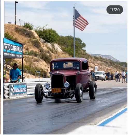
32 at the line