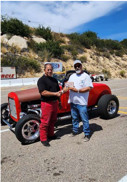
Torres Family Bracket 1