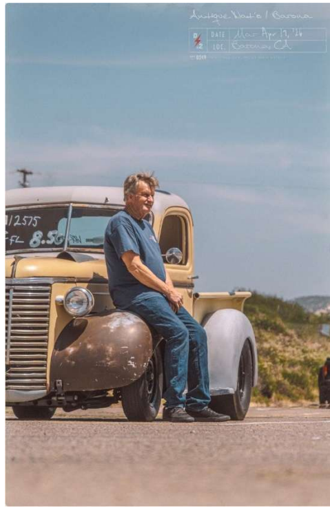
Flathead/Inline Six Contender