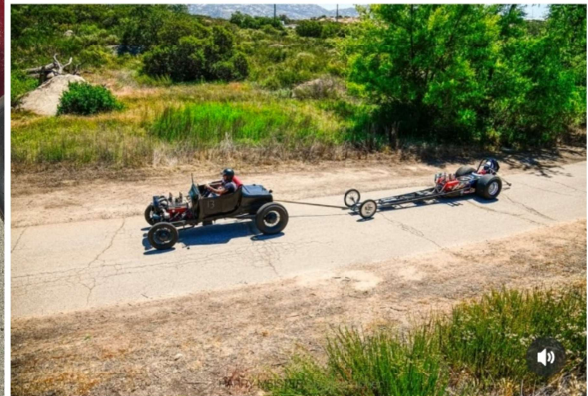
Cool Tow Car