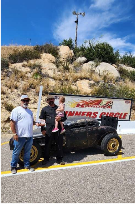
Adrain Street Flathead A/E